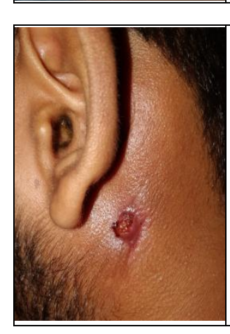
Figure 2. Ulceration with Yellowish Crust. Scar Seen Over Surrounding Skin